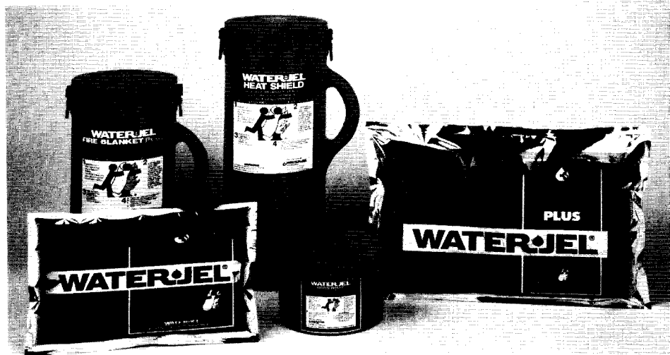
Water-Jel Emergency Burn Treatment products.

Officers Thomas Negro and Higgins delivered additional supplies the following day including water, socks, and clothing to the Red Cross set up at the Trade Center Building 7 before it collapsed.